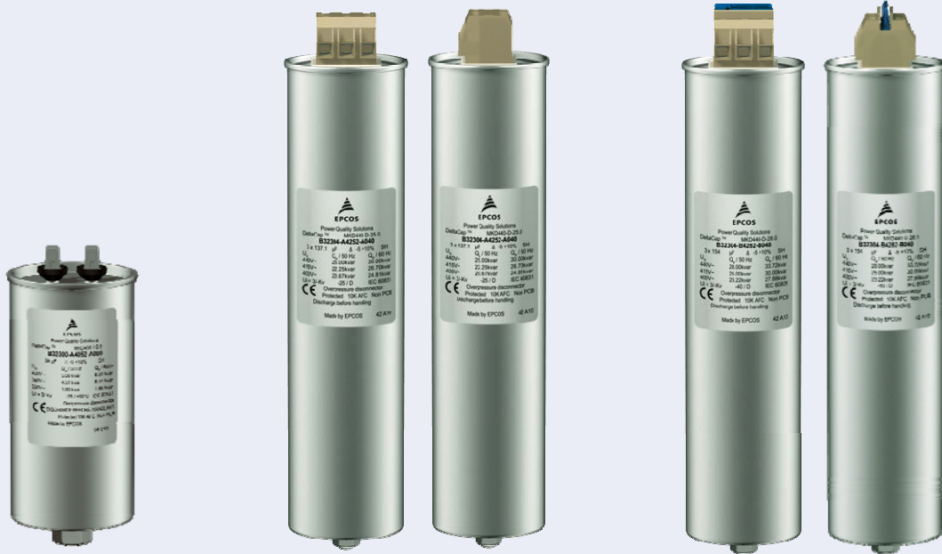
B32300 / B32303 series